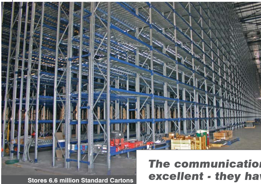
Stores 6.6 million Standard Cartons

“The communication from Dexion is excellent,” said Fullagar, “they have encouraged a transparent relationship from the very beginning and we are happy to see that any problems are addressed immediately and openly. We feel we are in a ‘win win’ situation with Dexion. They understand our business, and they’ve proved over the years that they are a very capable storage solutions supplier. Together we can plan facilities, both here and overseas, into the future,” she said.