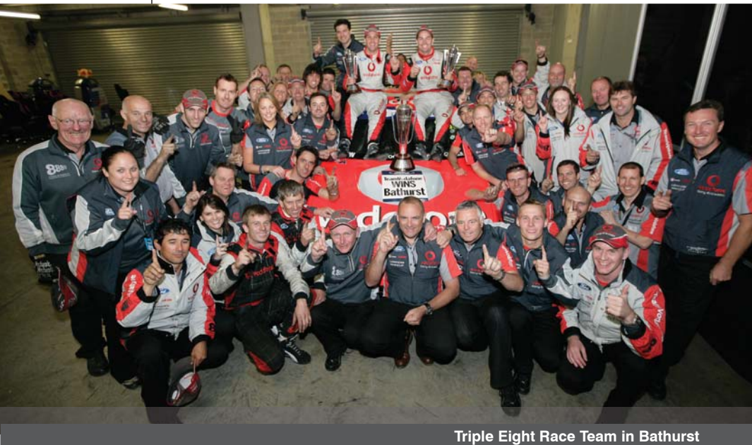
Triple Eight Race Team in Bathurst

and is testament to the cars being produced by Triple Eight with the chassis winning on debut.”