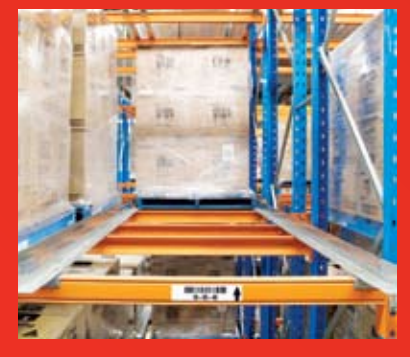
Upper levels can be fitted with guide rails to assist operators in locating pallets.