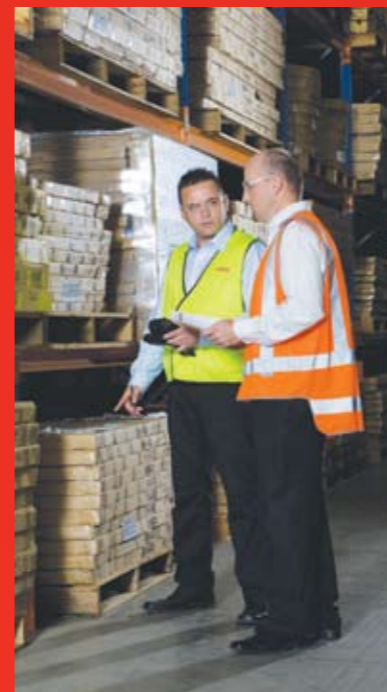
Show your commitment to workplace safety with a Dexion scheduled service plan.