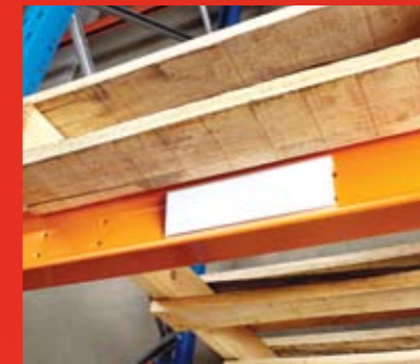
Improve identification with Dexion's self adhesive label holders. I-Beam label holder on upper level.