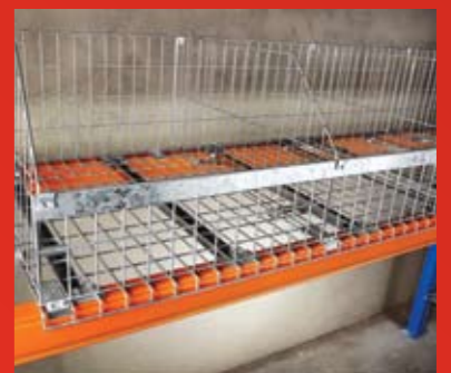
Mesh binning for small parts storage.