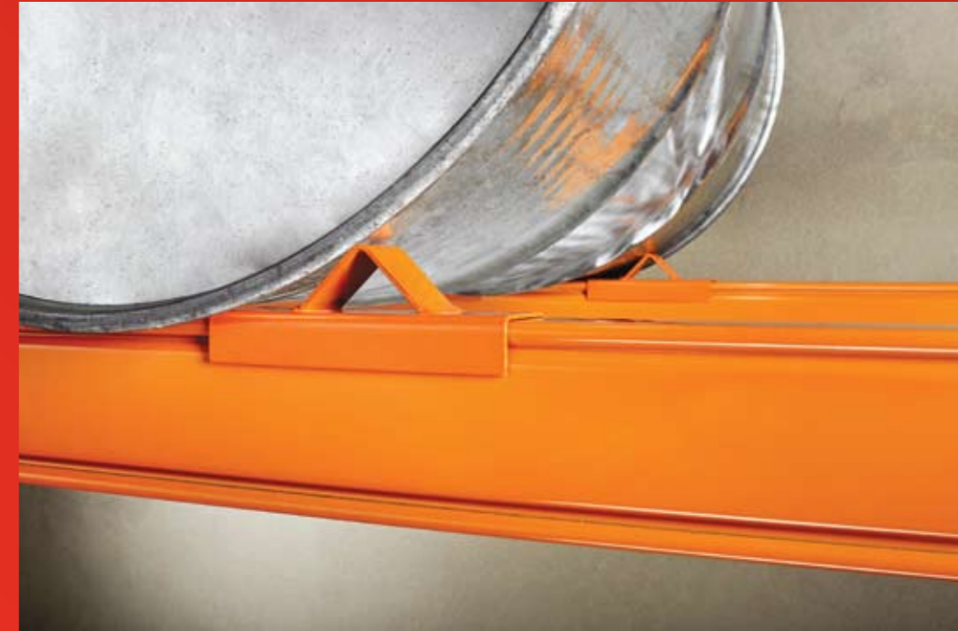
Awkward loads such as coils or barrels are easily secured using barrel chocks.

Smarter thinking to help operators work faster and safer.