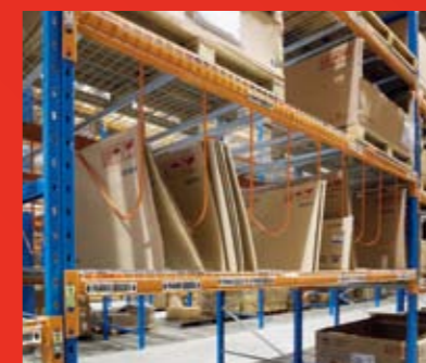
There are different Keylock dividers for different business needs.