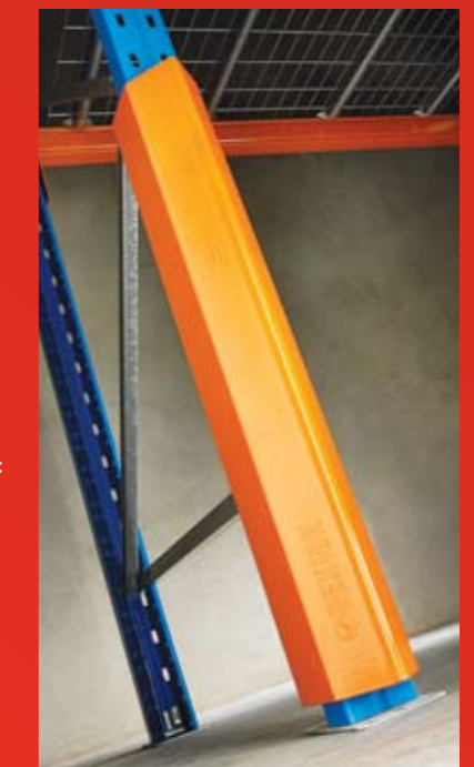
Clip-on, wrap-around SmartGuard upright protectors provide protection to a height of 800mm.