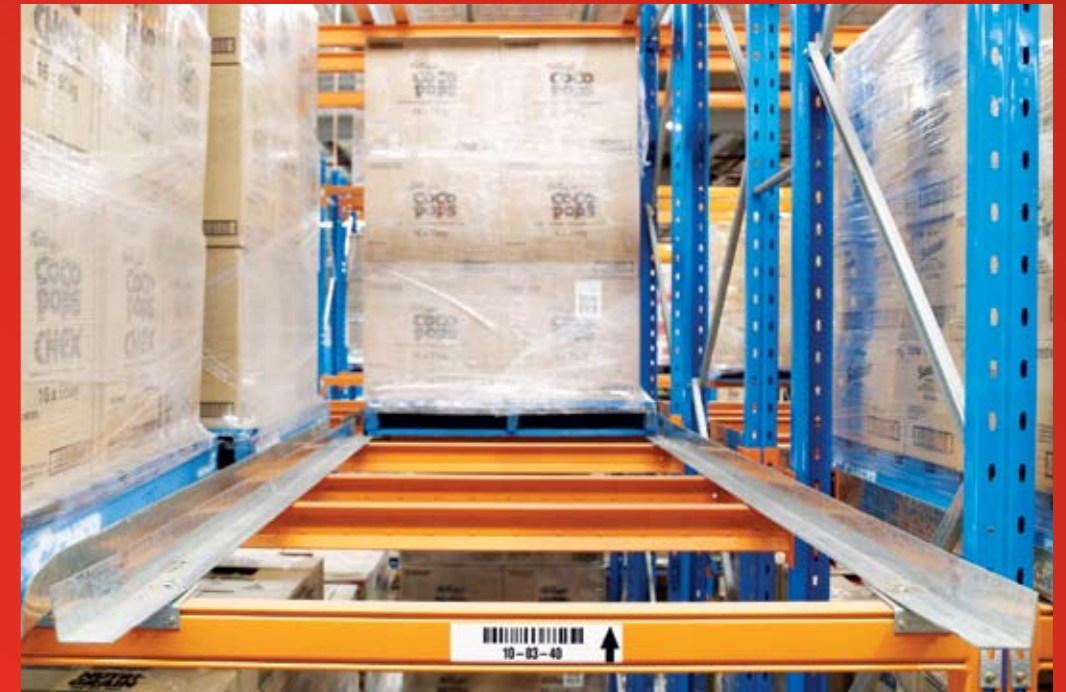
Double deep rails assist operators to locate pallets within the rack.

More ideas for working faster and safer.