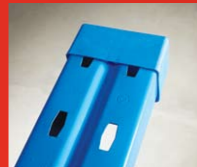
Moulded upright cap.