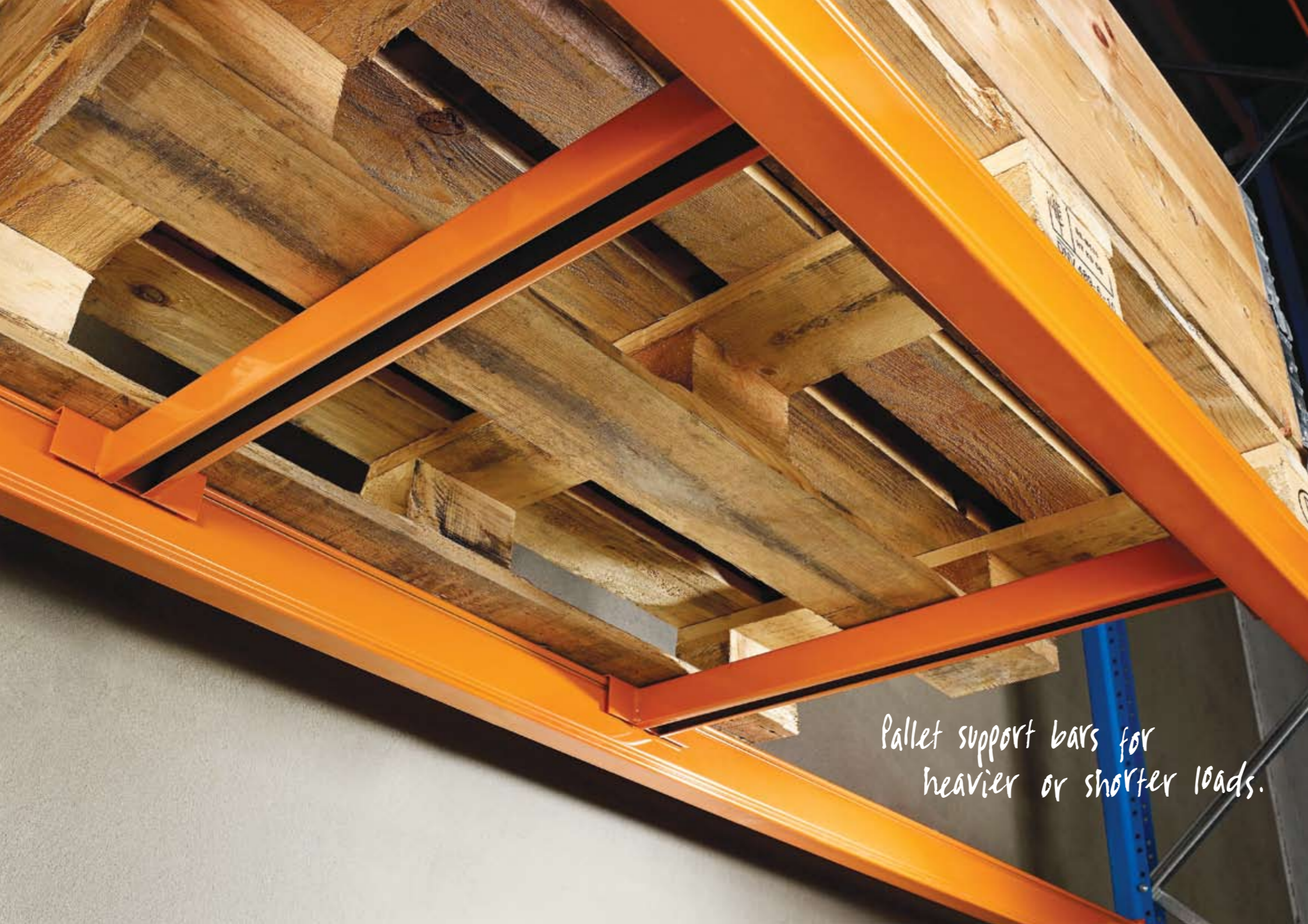
Pallet support bars for heavier or shorter loads.

More ideas for working faster and safer.