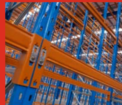
In addition to our 12 month standard warranty, Dexion offers its customers the Dexion Lifetime Product Warranty, which covers structural failure and defects in material and workmanship in new products manufactured by Dexion.