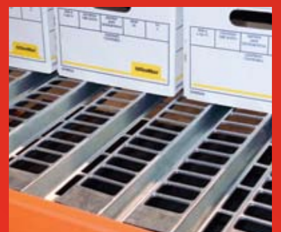
Punch deck features a flat 50% open storage platform that provides efficient circulation of air, light and fire sprinkler water.