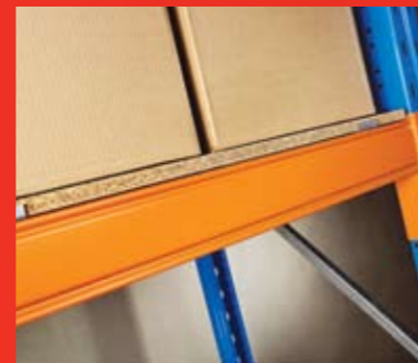
Chipboard retainers allow you to secure particleboard to beam levels.