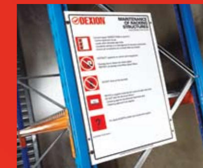
Maintenance signs provide basic rack safety rules. AS 4084 compliant.