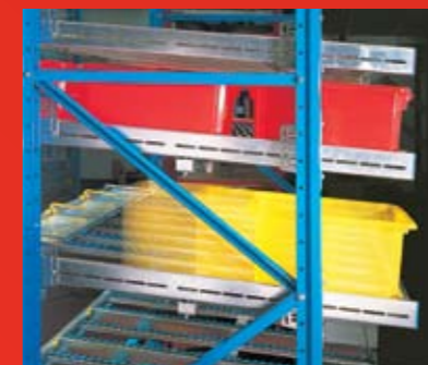
Increase order picking efficiency by incorporating carton live storage.