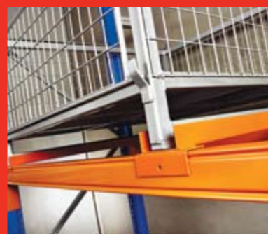
Skid channels provide for safe placing and removal of skids and stillage by operators.