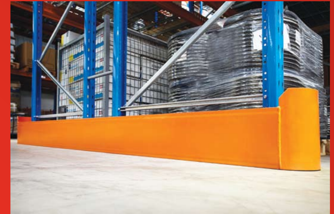
Rack end protector guards against errant fork lift trucks.