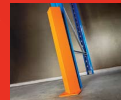
Bolted upright protectors provide protection to a height of 600mm.