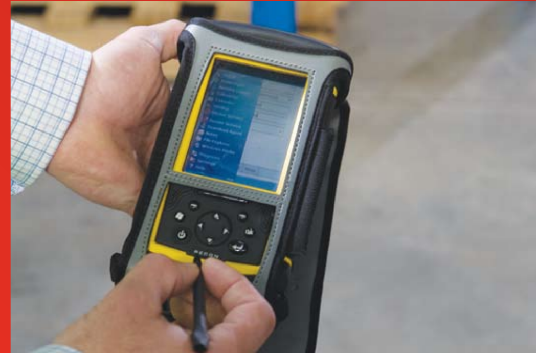
On-site rack inspections with on-the-spot reports.

There's nothing more important than workplace safety.