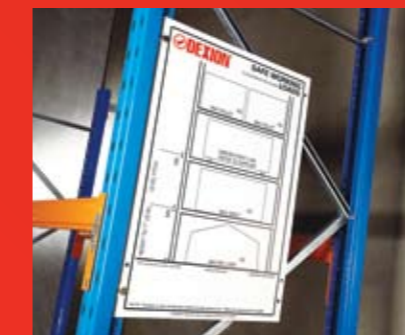
Safe working load signs indicate maximum safe loading limits. AS 4084 compliant.