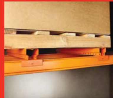
Fork entry bars for unsuitable pallets or unpalletised loads.