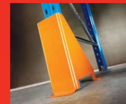
Floor-bolted column guards provide protection to a height of 360mm.