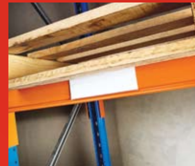
Box beam label holder.