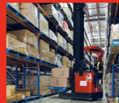
Operator training. The more they know the safer they'll operate.