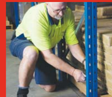
Relocations, repairs and maintenance are all part of the service.