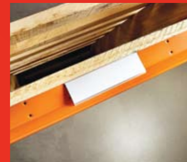
I-Beam label holder on lower level.