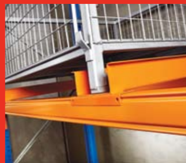
Post pallet channels provide a safe seating platform for post pallets.