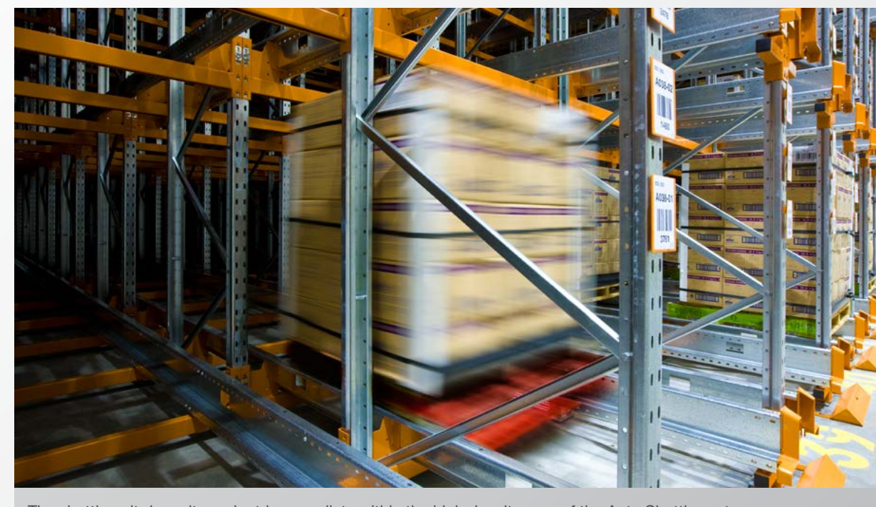
The shuttle unit deposits and retrieves pallets within the high density core of the Auto Shuttle system.

A conventional forklift truck places the pallet on the rails ready for the Auto Shuttle to move the pallet into position. Similarly it collects the pallet from the front of the rack once retrieved by the Auto Shuttle. Pallets sit on their own rails, facilitating access of pallets on each level. The forklift does not enter the racking structure. This ensures the safety of the forklift driver, and prevents damage of the rack.