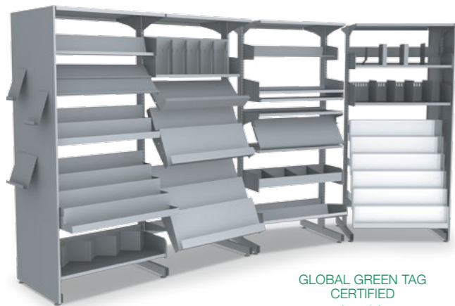
GLOBAL GREEN TAG CERTIFIED Level A

Precision® Library Shelving 2 is ideal for academic, corporate, public and legal libraries as well as general office applications. It is adaptable to both stationary and mobile storage applications. Available with a wide range of configurations and accessory options.