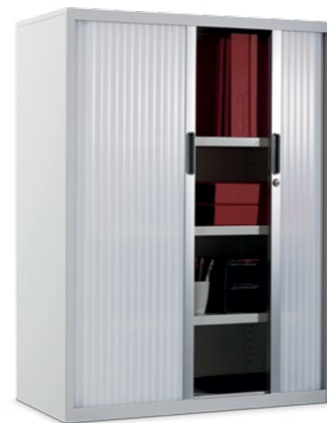
ENVIRONMENTAL CHOICE AUSTRALIA DEX-2009 GECA 28-2006 Furniture and Fittings

This powder coated bookcase provides ready accessibility, showcasing all contents, with the flexibility of an option to convert the unit to a secure, enclosed cabinet with a swing door or tambour door.