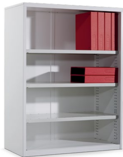
ENVIRONMENTAL CHOICE AUSTRALIA DEX-2009 GECA 28-2006 Furniture and Fittings