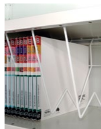
Suspended filing rack.