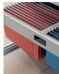
Suspension filing drawer.