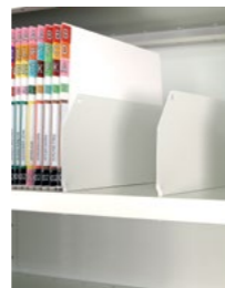
Slotted shelf divider.