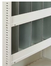
Bin fronts/back stops.