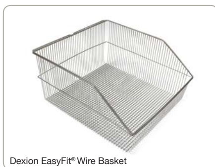
Dexion EasyFit® Wire Basket