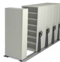
Single bay Mekdrive 3 Compactus ®