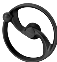
Mekdrive 3 hand-wheel

Users of the Dexion Freetrack system can easily upgrade from their existing hand operated unit to the Mekdrive 3 system for improved operation.