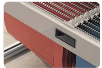
Suspension filing drawer