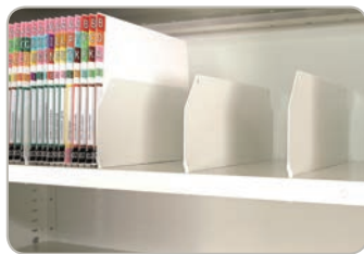
Slotted shelf divider