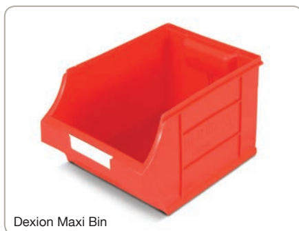
Dexion Maxi Bin