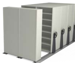
Two bay Mekdrive 3 Compactus ®