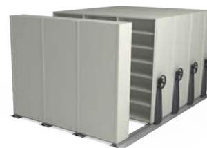
Three bay Mekdrive 3 Compactus ®