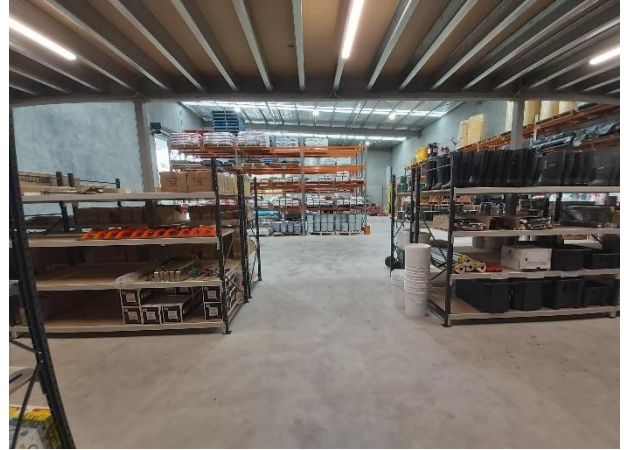
Inside CCW's Warehouse