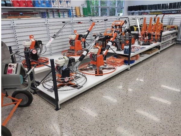
Longspan Display Shelving

The end result? Gary Bishop- Owner of CCW says: “We have properly organised and displayed all our stock. The storage systems provided by Dexion Acacia Ridge meet all our requirements so we can better serve our customer base. We ended up with a combination of Pallet Rack, Longspan Shelving, Conduit Rack and External Cantilever Rack”.